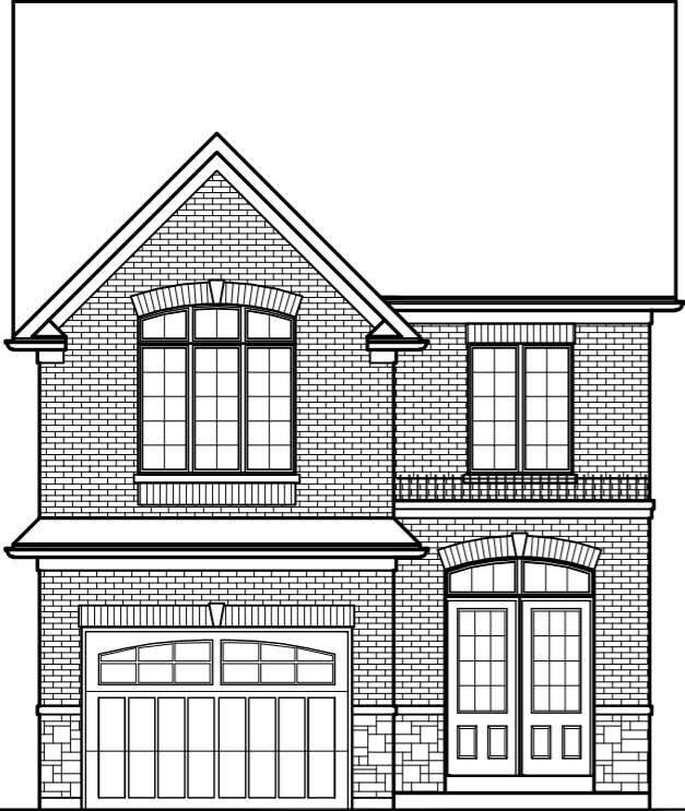
FRONT ELEVATION 'B'