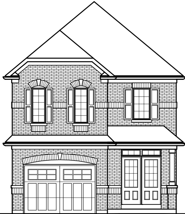
FRONT ELEVATION 'A'