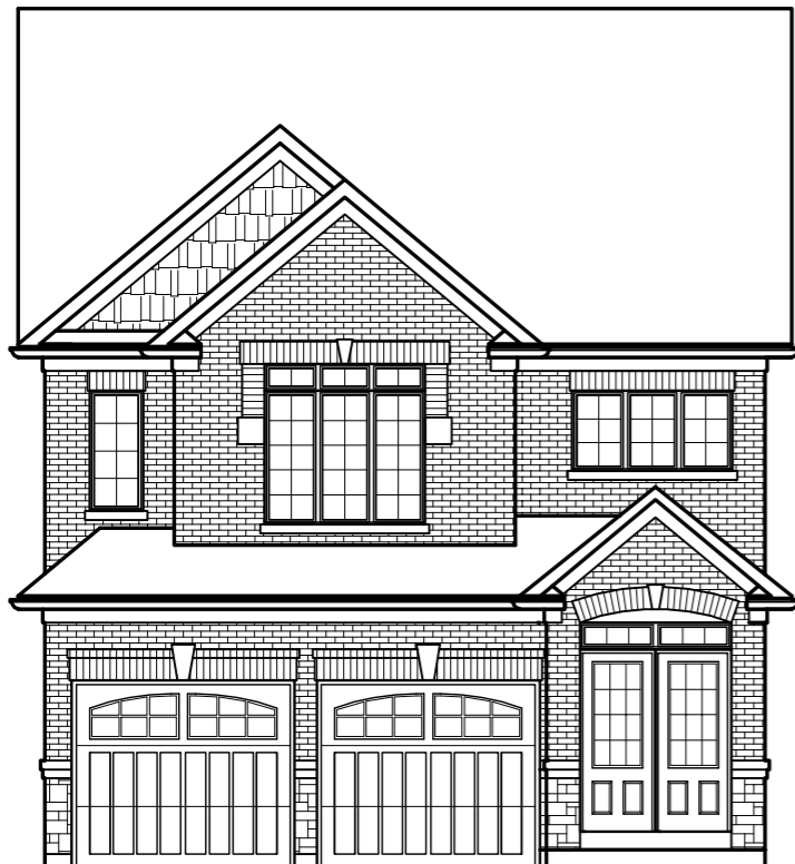
FRONT ELEVATION 'B'