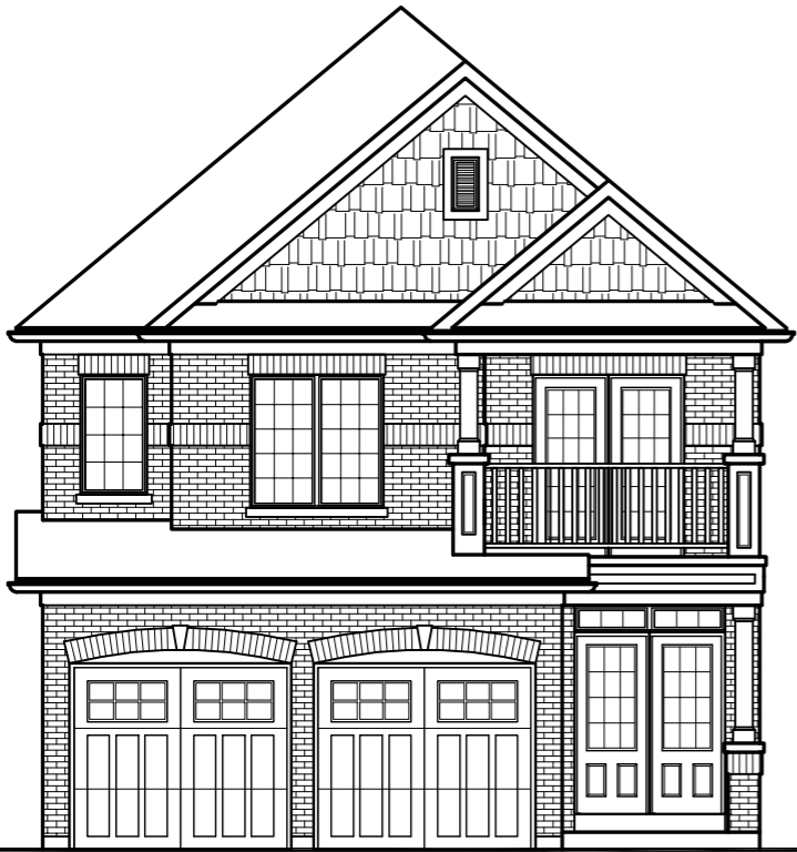
FRONT ELEVATION 'A'