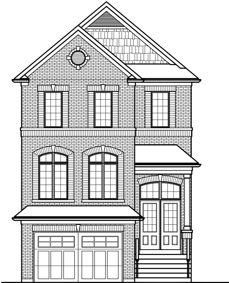
FRONT ELEVATION 'A'