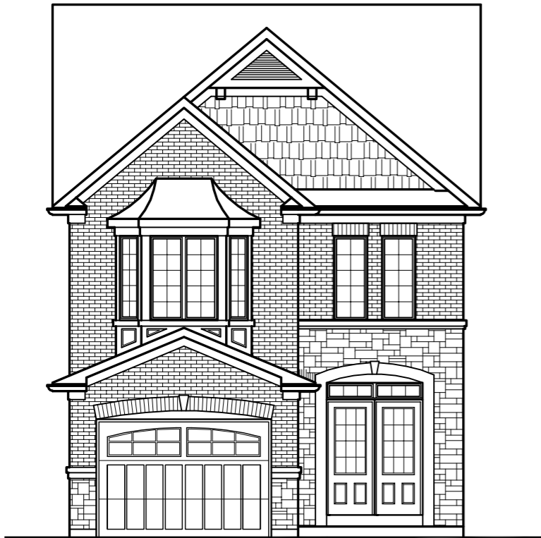
FRONT ELEVATION 'B'