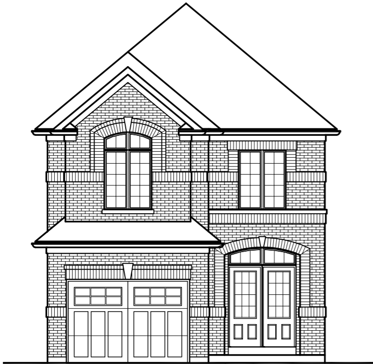
FRONT ELEVATION 'A'