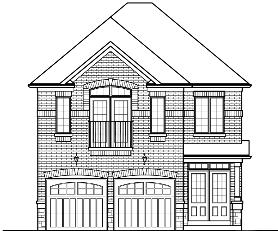
FRONT ELEVATION 'B'