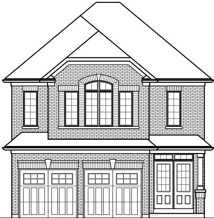
FRONT ELEVATION 'A'